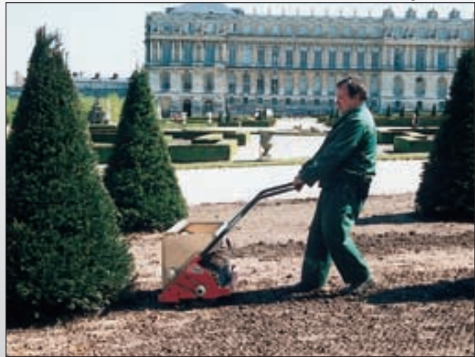
Seeding of small areas with the Seedy