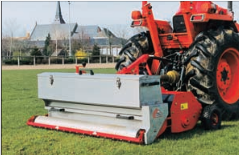
The Overseeder CR 140 for Sportsfields & fairways